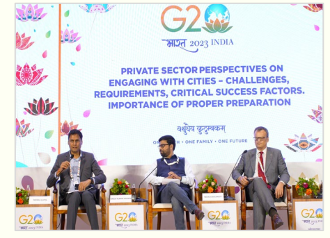
Side event organized by IFC to capture private sector perspective on engaging with Cities

In addition to formal discussions, excursions were organized for the delegates to enlighten them about the rich history and culture of Khajuraho. Visits were organized to the famous UNESCO World Heritage site at the Western Group of Temples, Adivart Museum and Raneh Falls.