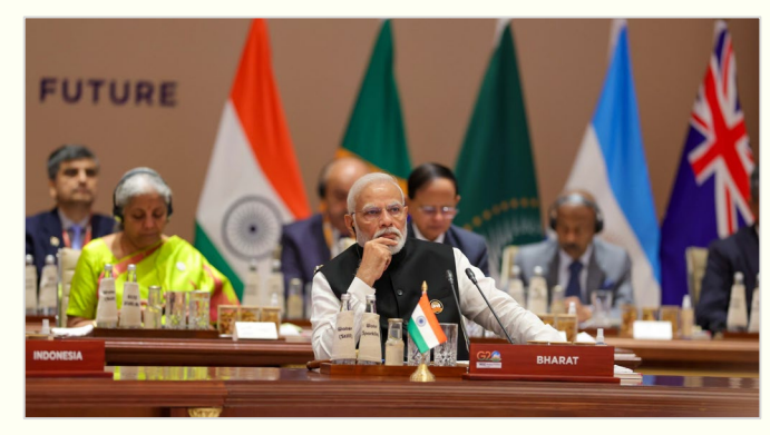
Hon'ble Prime Minister, Hon'ble Minister of Finance and Corporate Affairs, Secretary (Economic Affairs) and other delegates at the G20 Summit, New Delhi

Under its first G20 presidency, India managed to achieve 100% concensus on all developmental and geopolitical issues concerning global economy, climate change and inclusive growth. The Leaders' declaration, adopted during G20 summit, was unanimously passed by all the G20 member countries, with agreement of China and Russia as major achievements.